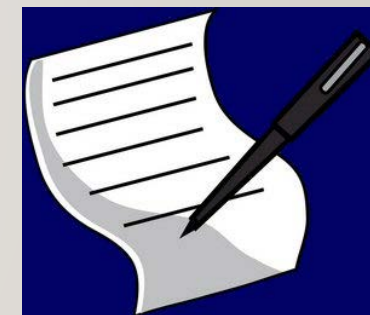
Consolidated project including budget items