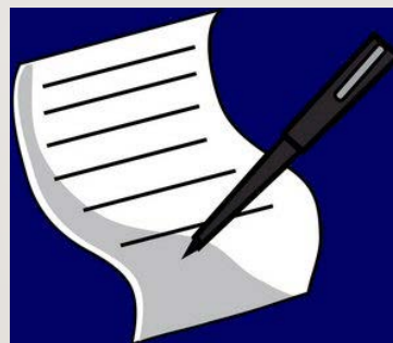
New project application with just the expansion information