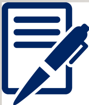
Renewal project application